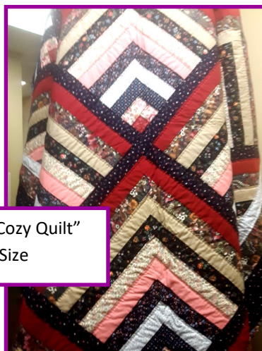
(C) "Cozy Quilt" King Size