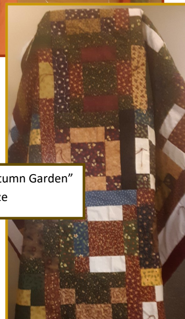
(D) "Autumn Garden" Twin Size