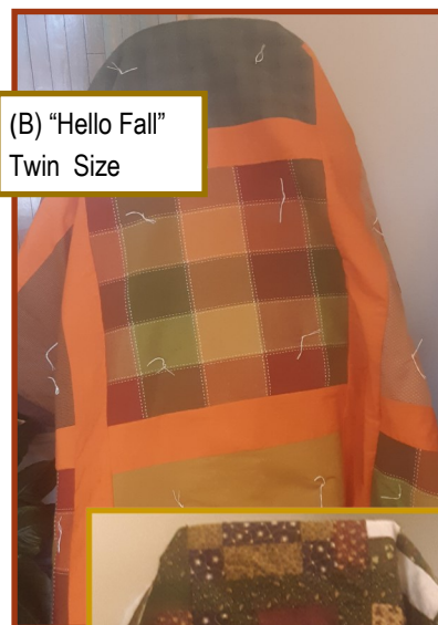
(B) "Hello Fall" Twin Size