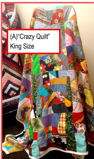
(A) "Crazy Quilt" King Size

Four quilts are being raffled. Tickets allow those who purchase tickets to indicate the quilt of their choice. Quilts are on display in the narthex.