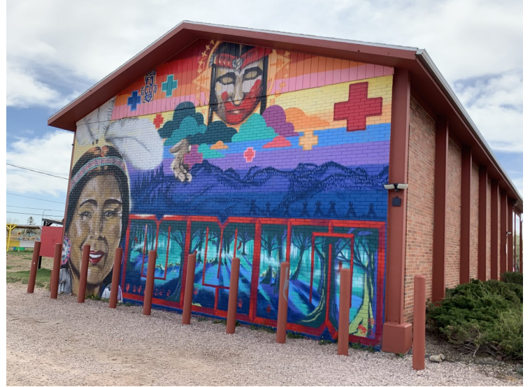
Woyatan Lutheran Church, Rapid City, SD