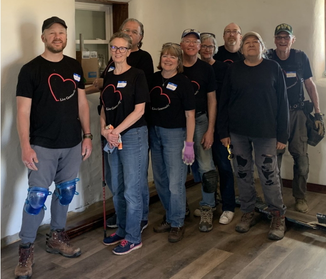
The flooring crew